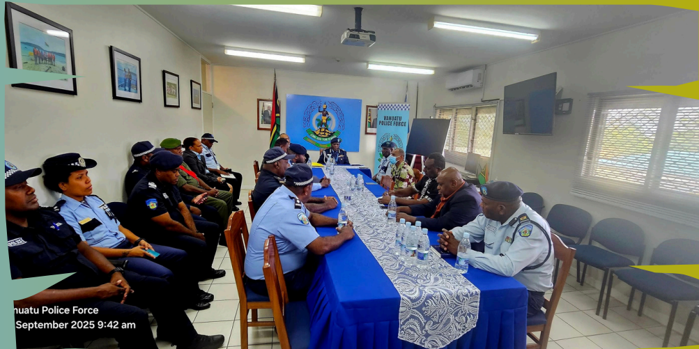
Vanuatu Police Force September 2025 9:42 am

The Commissioner of Police, together with the Chairman of the Police Service Commission officiated a significant round of promotions and appointments within the Vanuatu Police Force. Six senior officers were formally promoted, while nine others received acting appointments to critical leadership roles. The event marks the Commissioner's first official promotions since assuming office, signaling renewed focus on strengthening the force's leadership and operational capacity.