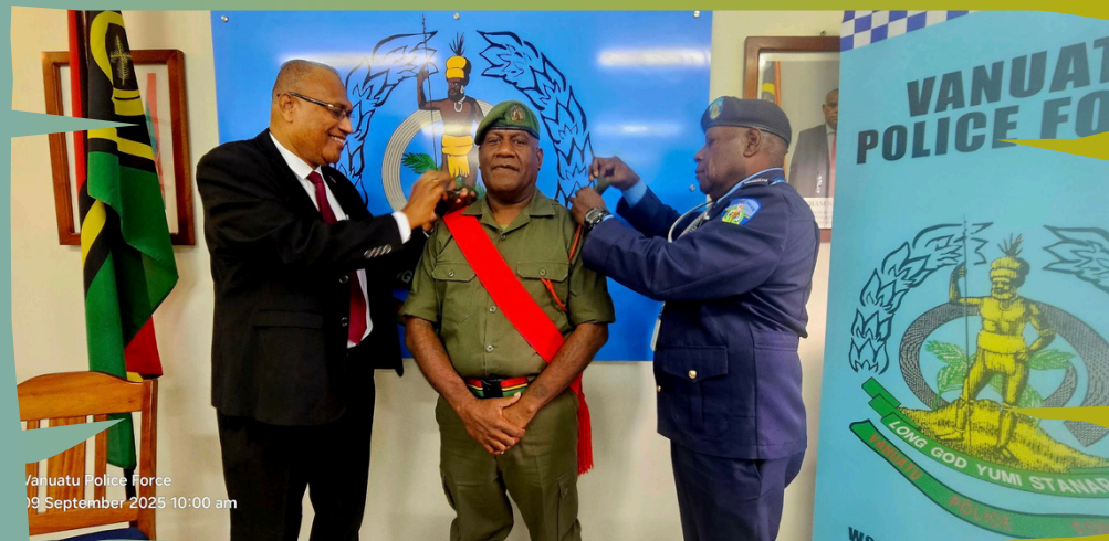
Vanuatu Police Force 09 September 2025 10:00 am

Promotions within the Police Force play a vital role in recognizing merit, boosting morale, and ensuring strong leadership across operational units. By elevating officers who have demonstrated commitment and professionalism, the organization continues to build a capable workforce that can effectively respond to national security needs and deliver quality policing services to communities across Vanuatu.